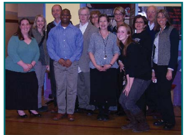
All collaborating partners and volunteers who made this event a tremendous success!