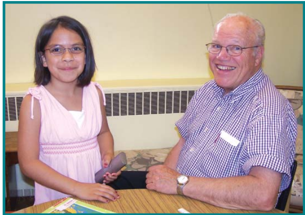
After MHSU school screening at James John Elementary, Essilor Vision Foundation donated the exam and eyeglasses for students in need.

The lives changed by the collaboration between Oregon Lions, your Foundation and community partners gives vulnerable Oregonians in need the help and hope they are desperately seeking during these challenging times.