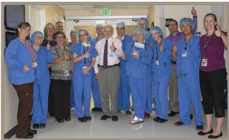
In June 2013, the Legacy Devers Eye Institute team restored sight to 14 individuals at their first Lions Mission Cataract event at Legacy Good Samaritan Hospital in NW Portland.